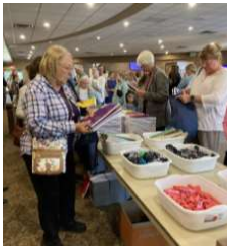
A beautiful line of people repeated going through until the supplies were out.